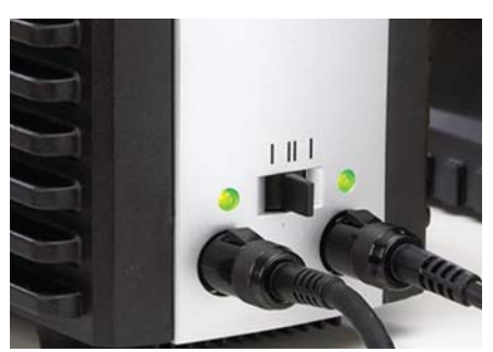
Three position switch. Select left, right or center (both ports operational) to power hand-pieces