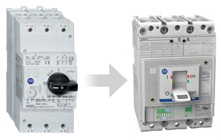
End of Life 140-CMN Motor Protection Circuit Breaker

For more information, consult the technical specifications and selection guide on www.ab.com