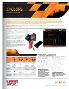
CYCLOPS LOGGER SOFTWARE

SEE OUR OTHER RELATED LITERATURE FOR THE CYCLOPS L: